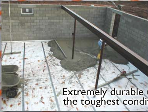
Extremely durable under the toughest conditions!