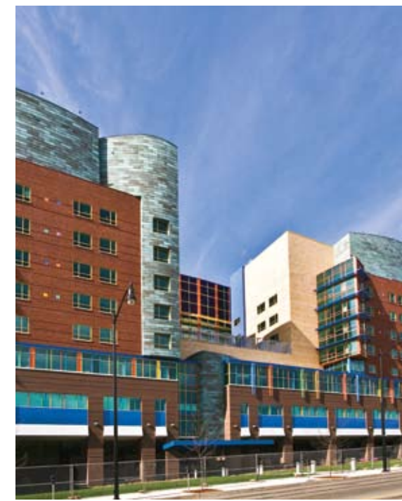
Children’s Hospital of Pittsburgh, UPMC, Pittsburgh, PA

The process to incorporate sustainable thinking in any project is really not that difficult. The difficulty is accepting that the older conventional practices need to be reconsidered. Change is hard for humans. It is the process of changing that is actually the most exciting aspect of reaching towards sustainability. The technologies will always be improving in sometimes subtle and sometimes significant leaps. When we build in a sustainable manner it is the change of perspective, the change of heart, and a fundamental reawakening of an awareness of our relationships to the systems of life that makes all this worthwhile.