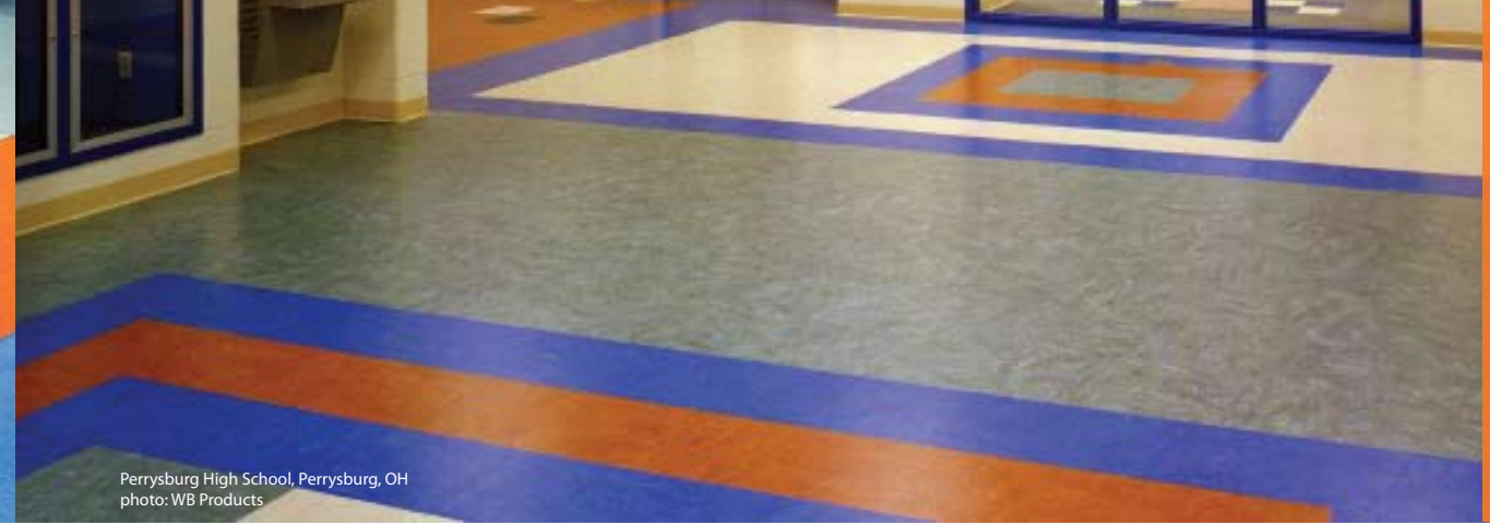
Perrysburg High School, Perrysburg, OH