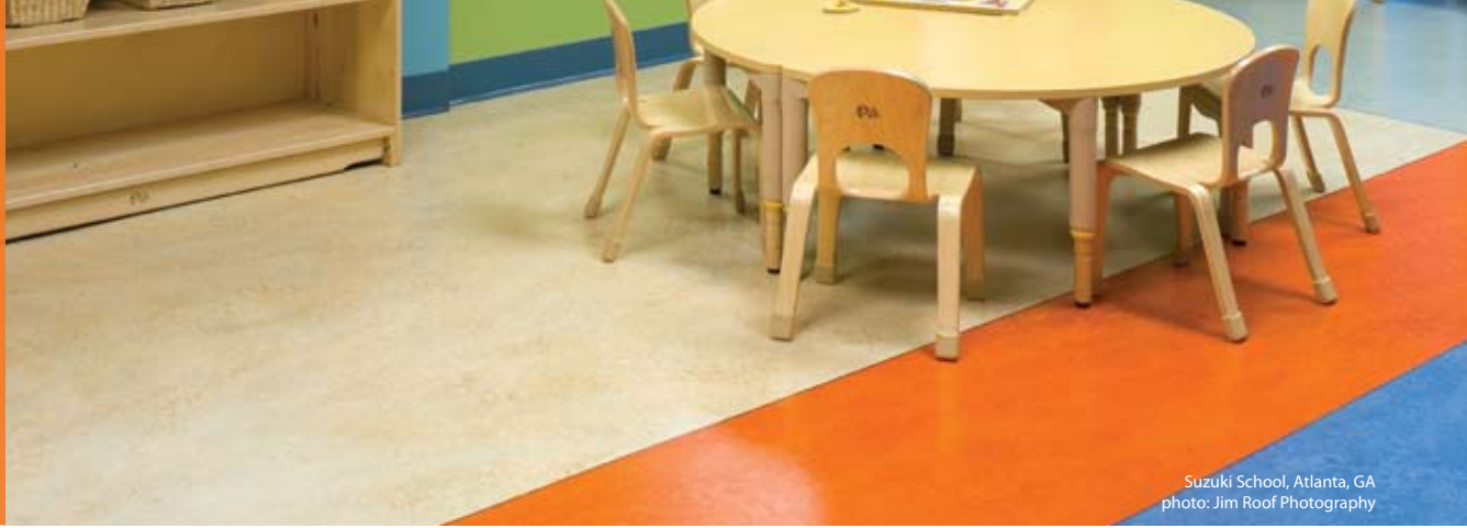
Suzuki School, Atlanta, GA